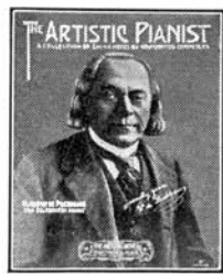
VLADIMIR DE PACHMANN